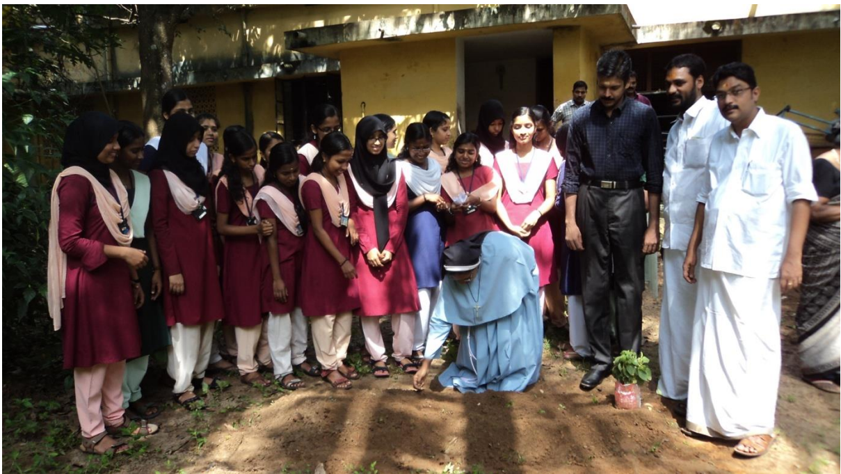
Vegetable garden construction in the premises of Agathimandiram

On 27 June, 2014 the students of the department had opportunity to visit Agathimandiram and acquaint with the destitute and poor. The greenery of the young minds were presented to them by planting saplings in their premises. A Vegetable garden was created in the premises of Agathimandiram on 28 th June 2014 by the HERBO COLLEGIUM members with Bhoomithrasena Club Members. Different Vegetable seeds such as Pulses, Ladies finger, Ash gourd, Bitter gourd and seedlings of Papaya and Amaranthus were planted after cleaning and preparing seed beds.